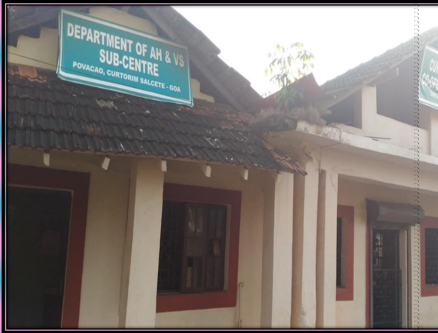
DEPARTMENT OF AH & VS SUB-CENTRE / CURTORIM SERVICE CO-OPERATIVE SOCIETY