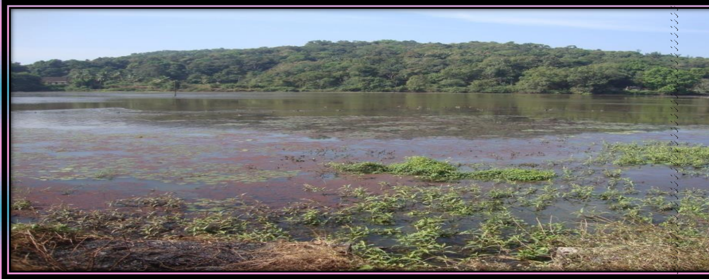
ANGDI TOLLEM CURTORIM