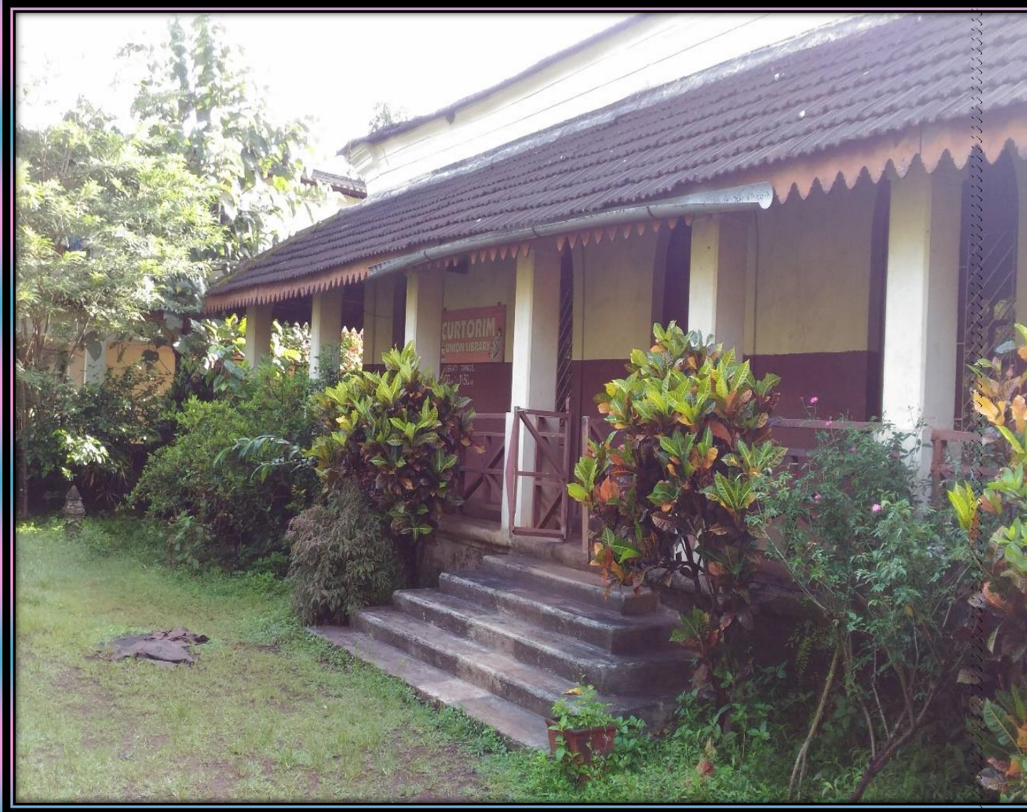
CURTORIM UNION LIBRARY