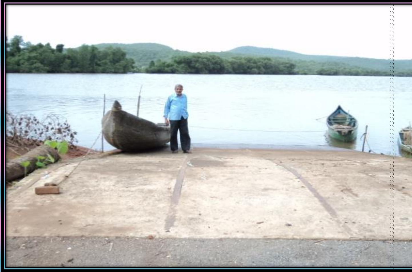
RAMP AT ULLANDO