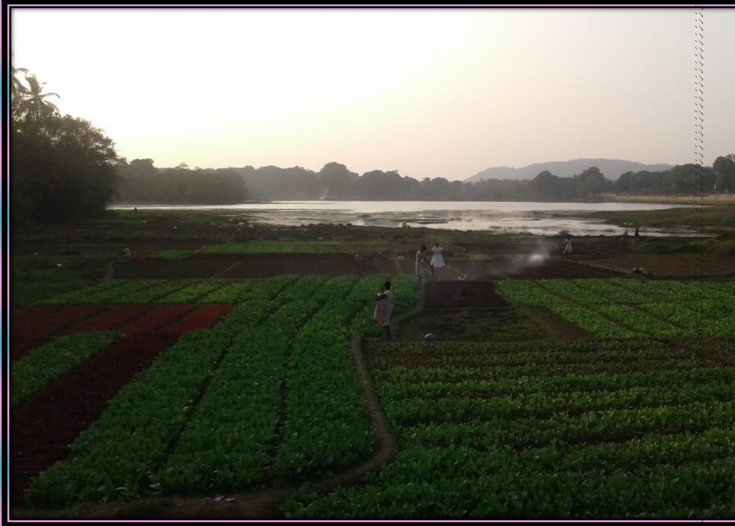
VEGETABLE PLANTATION IN CURTORIM