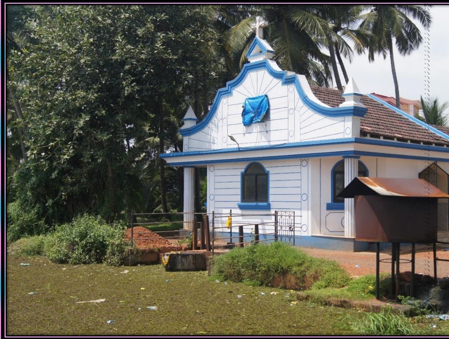
HANDI CROSS AT MAINA AND SLUICE-GATE