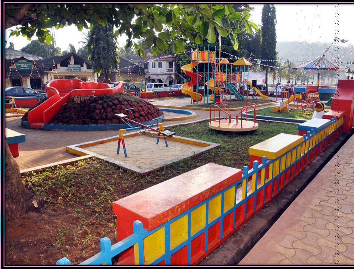
ST. ALEX CHURCH GARDEN