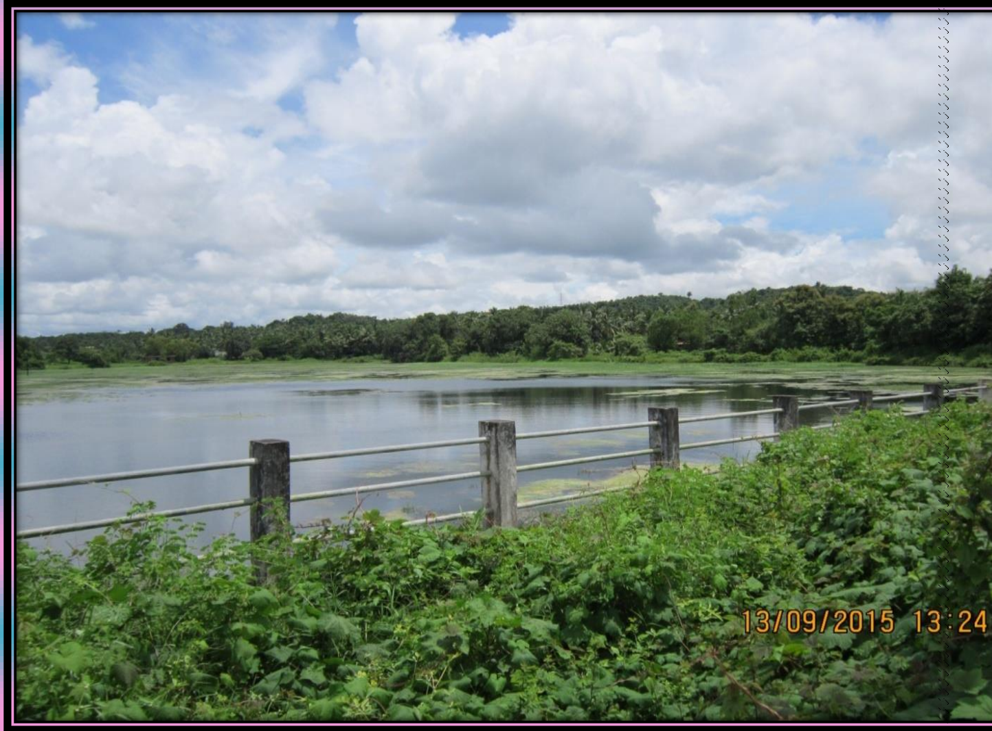
MAI TOLLEM CORJEM