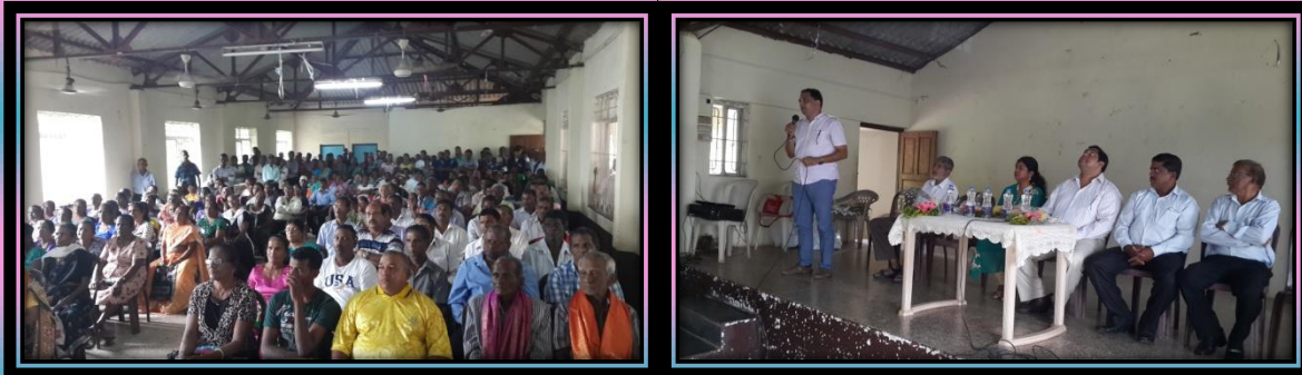
Focused group discussion with Farmers