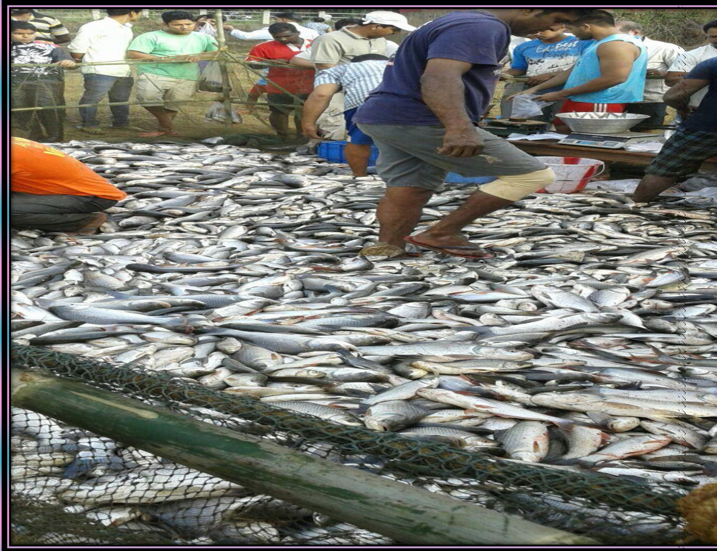
FISHING ACTIVITY AT MAITOLLEM LAKE