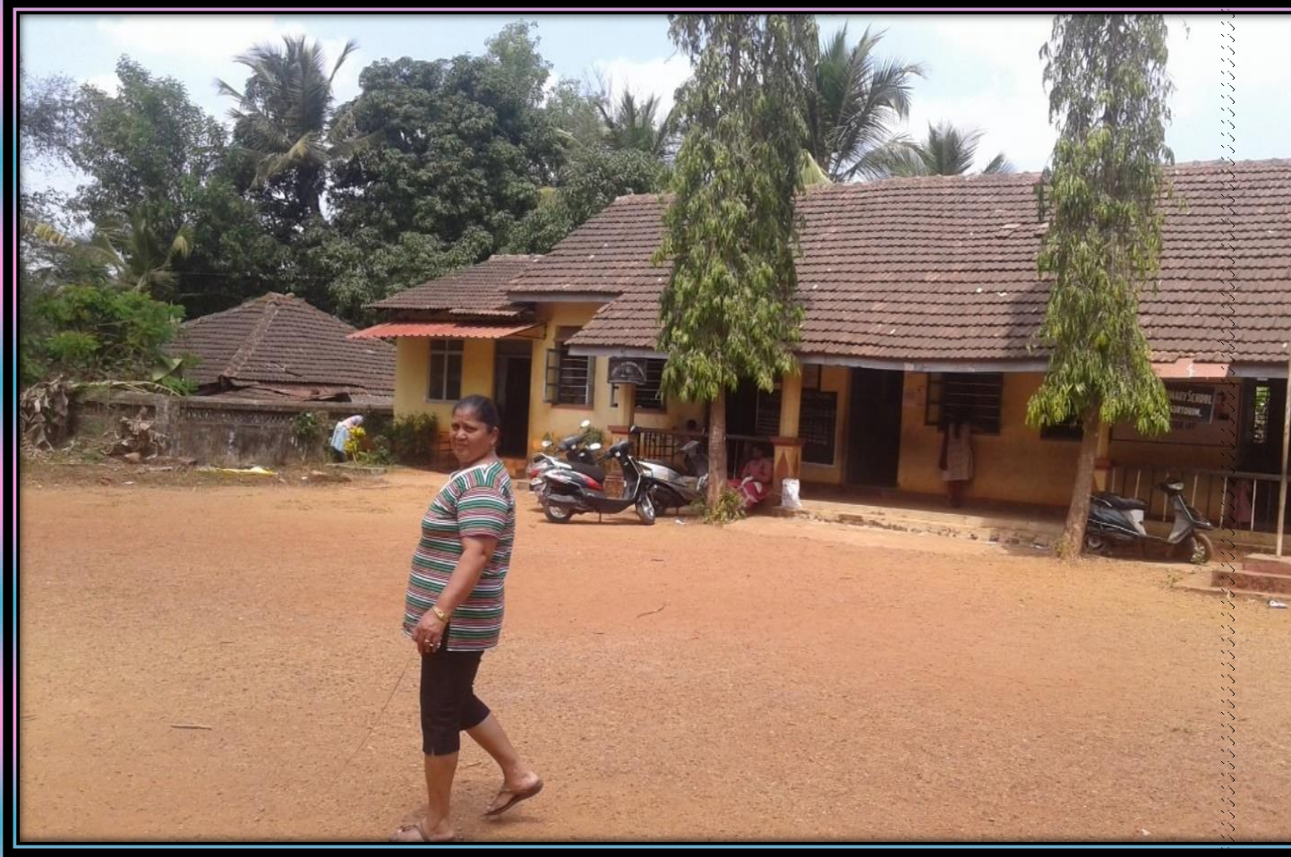
GOVERNMENT PRIMARY SCHOOL AND ANGANWADI