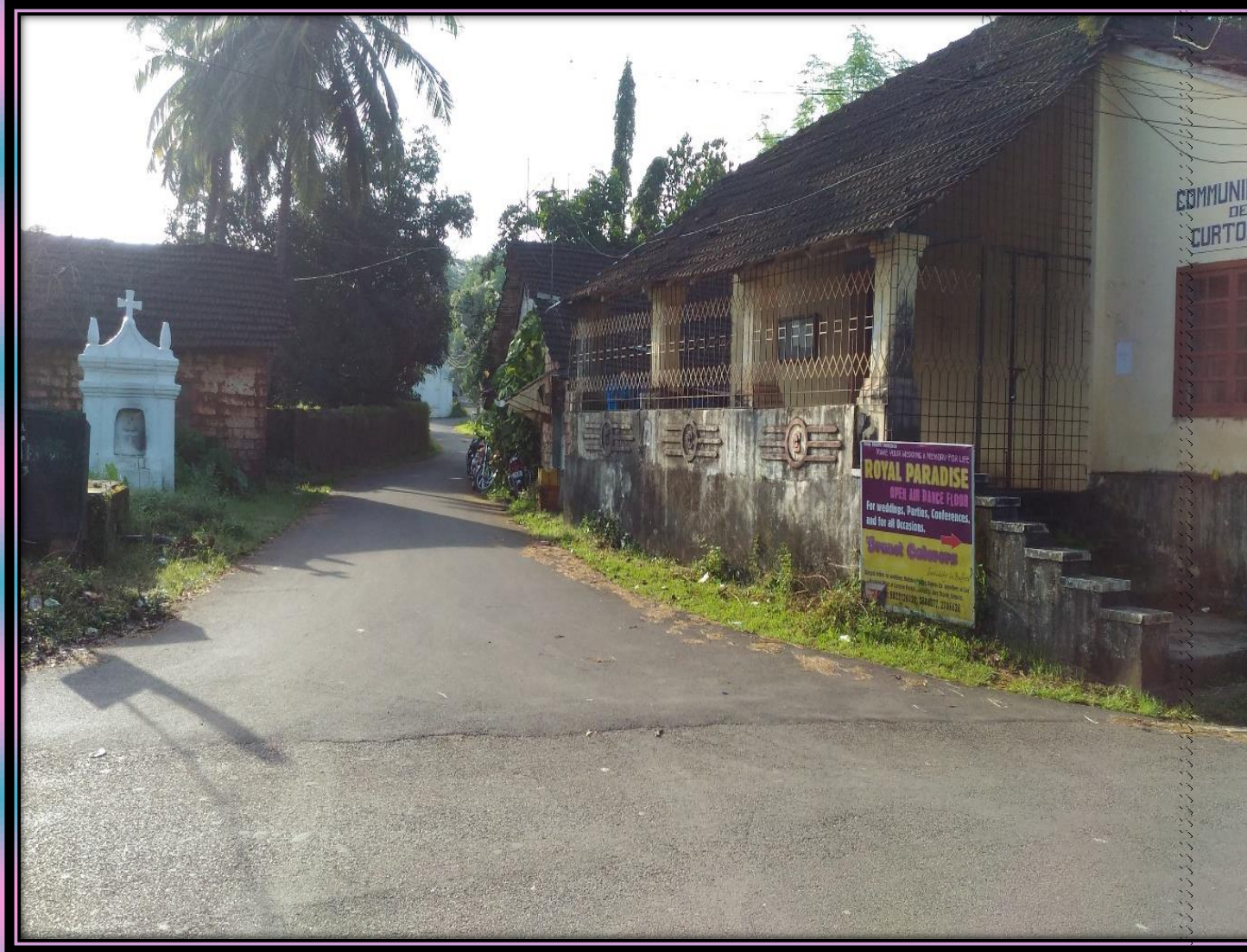
COMMUNIDADE OF CURTORIM