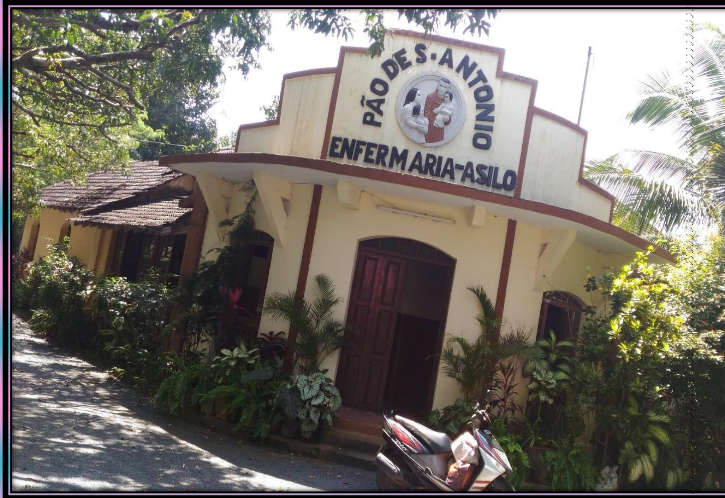
OLD AGE HOME