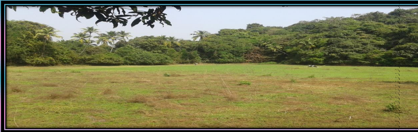
GUD TOLLEM AGXEM