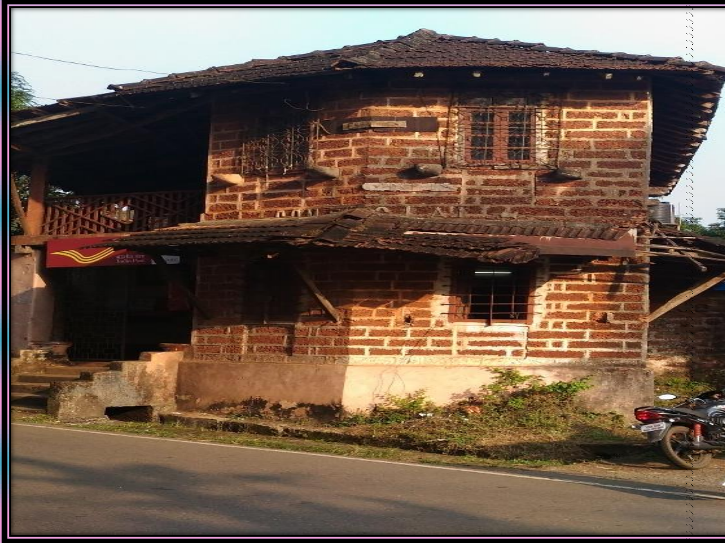
POST OFFICE CURTORIM