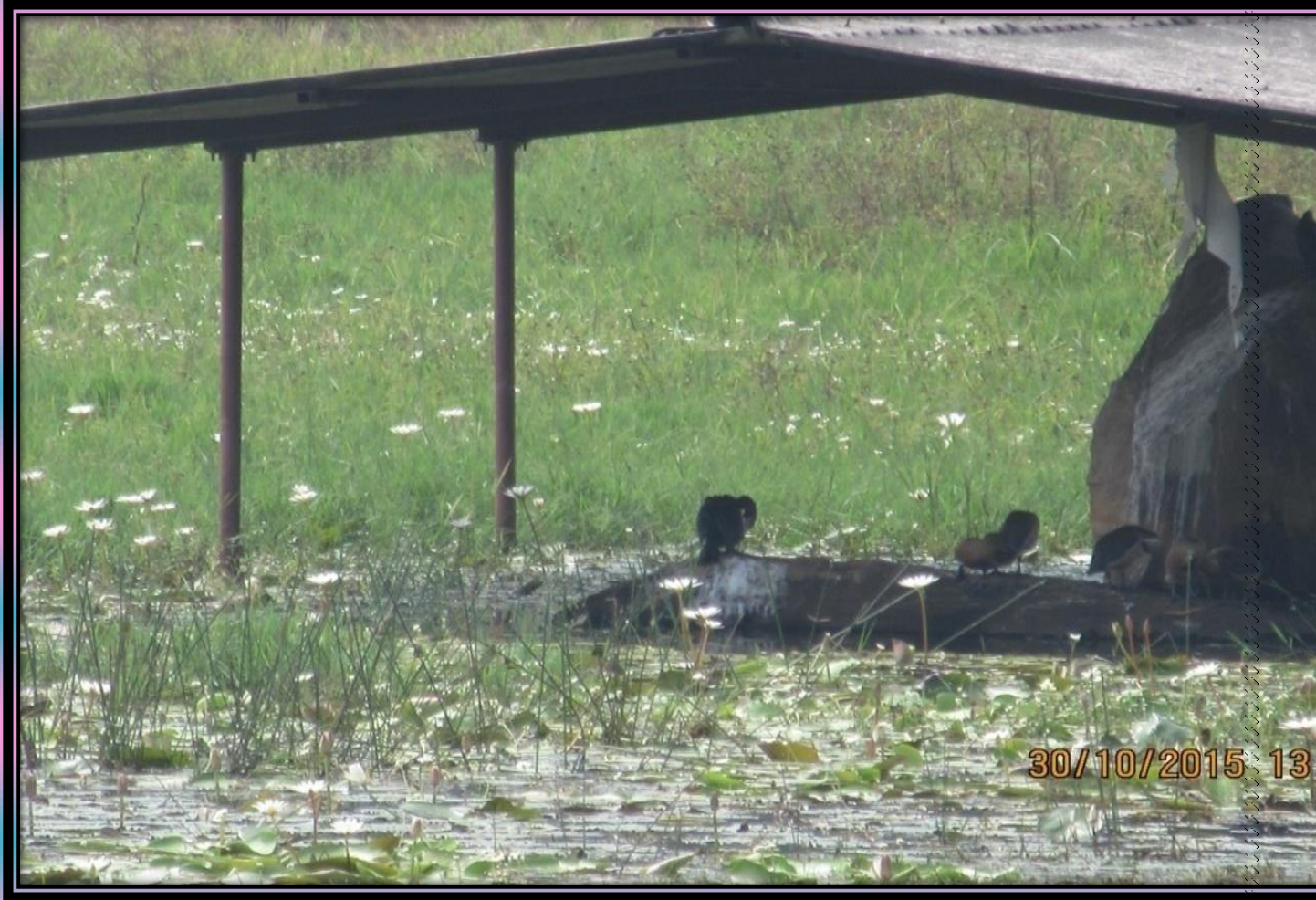
HERITAGE SITE IN RALLOI TOLLEM