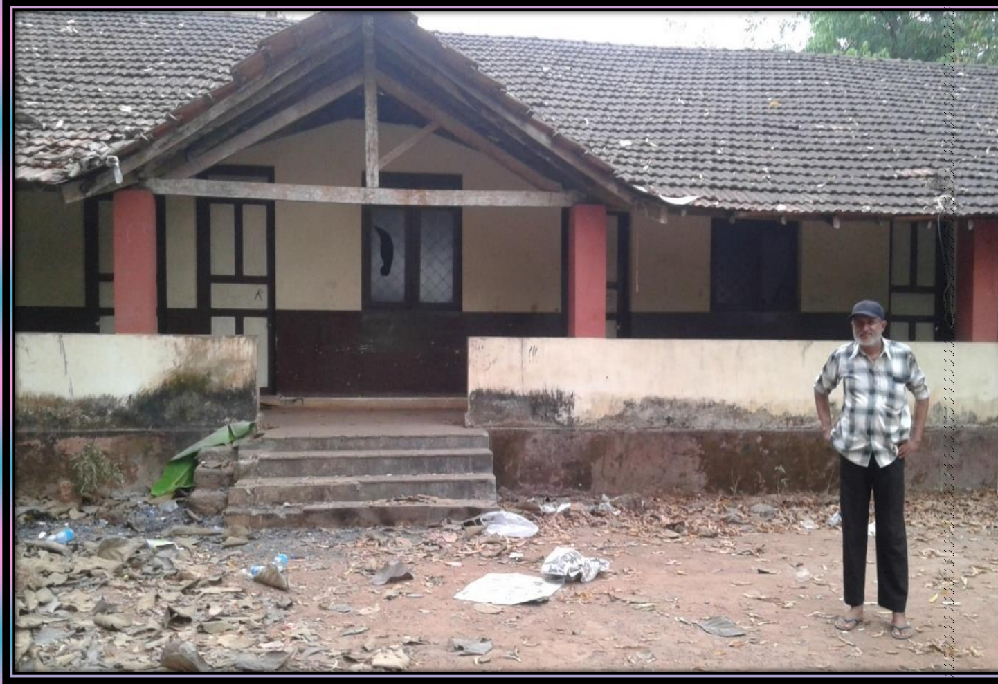
GOVERNMENT PRIMARY SCHOOL VIRABHAT